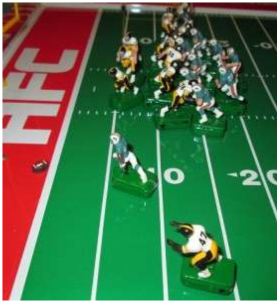
Greisy to Warfield to start the Dreampete for Miami.