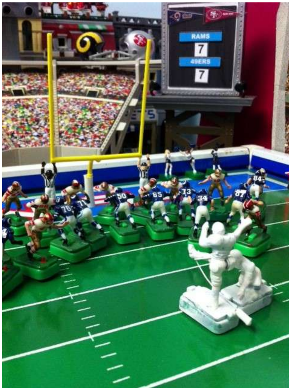
What a picture! What a set up! Rams vs. 49ers in the Dirty Bird EFL.

On The Move: Colorado Buffalos (Dre) Colorado Buffalos (BW)