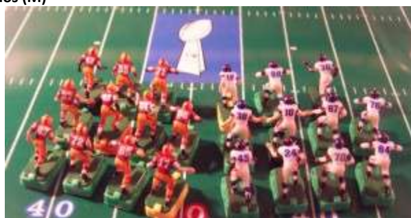
Legends II Tournament Giants vs. Redskins Pre-Game

On the Move: USC Trojans (BW) Colorado Buffalos (M)