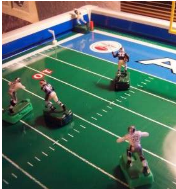
O.J. ran away from the Raiders putting Buffalo in the CAPanther Superbowl!

It will be an exciting final month and a half in the SCPC!