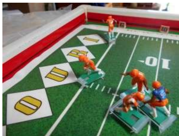
Big-8 action and the first Invisabases being used in SCPC play