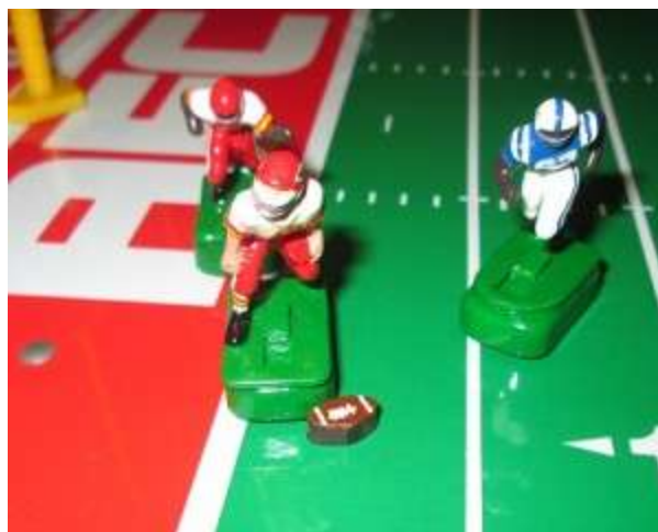
Dream Season II is underway.