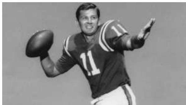
Name this SCPC star.