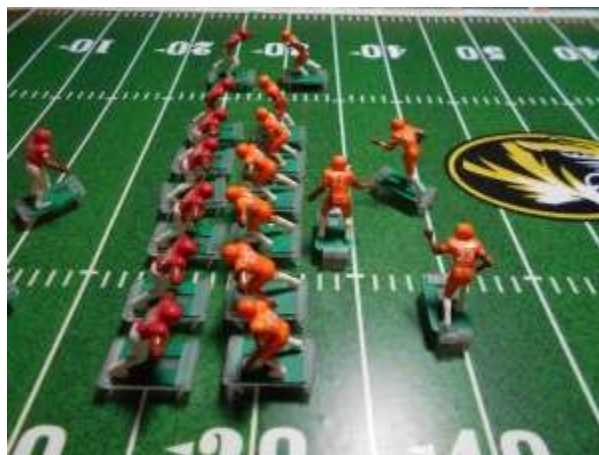
Big - 8 OSU vs. OU

On the Move: 2012 Atlanta Falcons (AM), Oklahoma State & Nebraska (DF), Miami (MV)