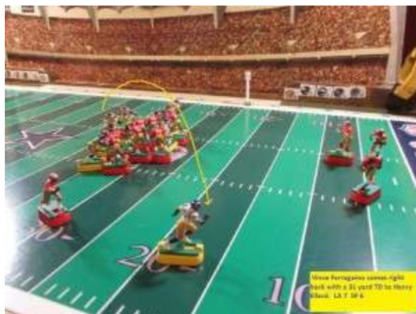
The Rams became the NJLMFL team to beat after defeating San Francisco.

A few more housekeeping notes. The rankings page is fixed up now so you can again go through the pages at the bottom of the table by clicking on the options. For some reason the arrows to sort the columns are not visible, but the column sort still works. Just click on the column heading. Some how the overall final rankings from season I did not get saved. I do have the correct top ten though. Not much, if anything changed below that anyway. I'll keep looking. Either way, keep in mind the season I rankings available on the SCPC home page are the final regular season rankings not the final rankings after bowl games were entered.