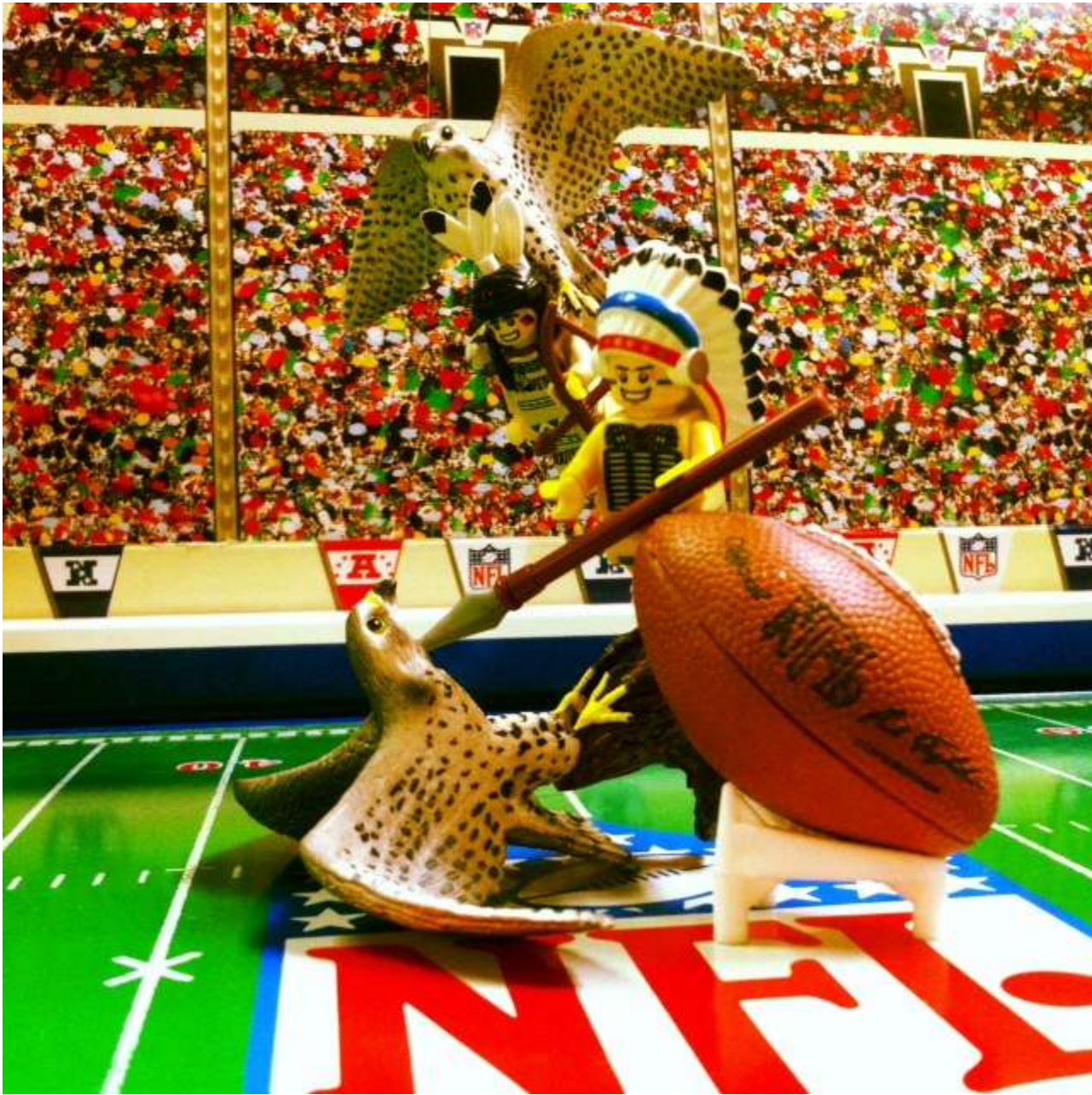
The Dirty Bird Electric Football League features various Atalanta Falcons teams and great Lego photo ops!

Now, all I want for Christmas is play some solitaire MF. Merry Christmas.