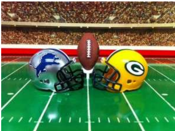
Thanksgiving Day in the SCPC