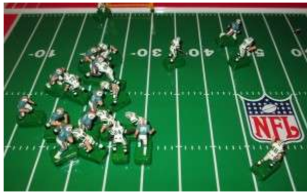
The defending champs win again.