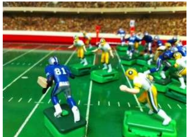
The Lions won in NFL and SCPC action.