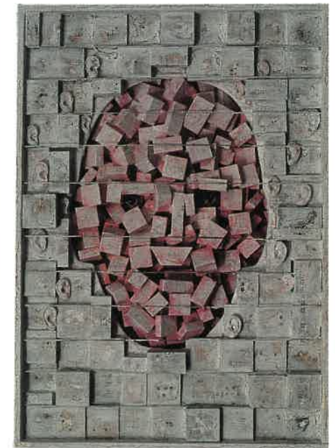
“The Quarterback Calls An Audible”

“TIMELESS MOMENTS” - JULY 24 - AUGUST 26, 1990 CANTON ART INSTITUTE