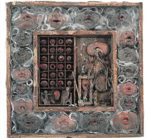
“The Heroes Talk To The Press”