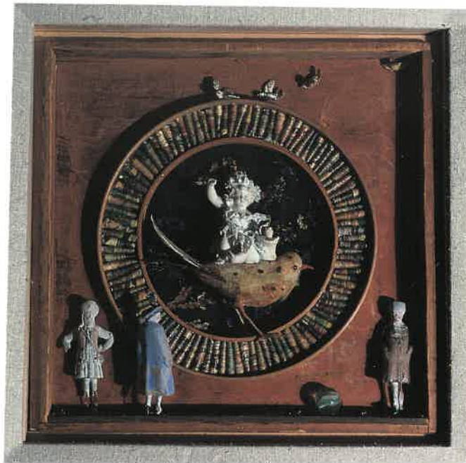
“Carnival Series: The Bird Lady Act”