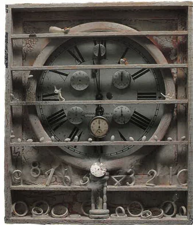
"Just A Few Seconds Left On The Clock"