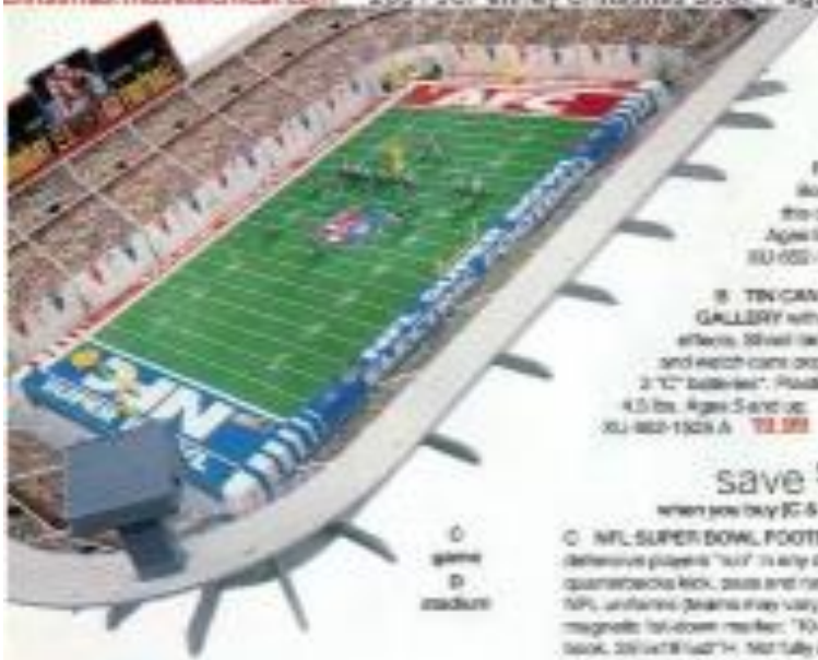
D game D stadium

christmas.musetechnical.com 2001 JCPenney Christmas Book Page 508