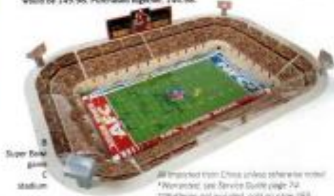
Super Bowl game C stadium

Save $5 when you buy the game (B) and stadium (C) together! Purchased separately, would be 149.98. Purchased together, 144.98.