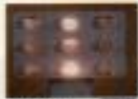
Close-up of stadium light

christmas.musetechnical.com 1999 JCPenney Christmas Book, Page 811