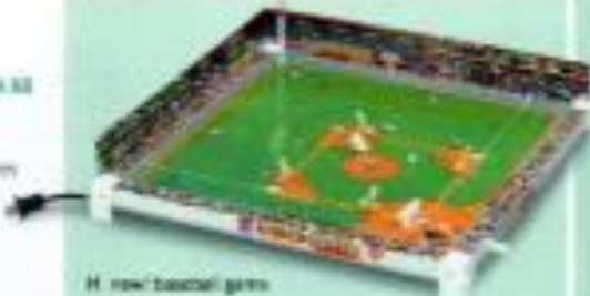
H. NFL baseball game 49 99

Play night games in a real lighted stadium. Comes apart for storage. For use with game (L) only. Requires 8 "AA" batteries.†† Easy to assemble. Plastic/metal. 54 1/2x38x12 1/2" USA and imported from China. Ages 8 and up. XU-052-1324 $9.99