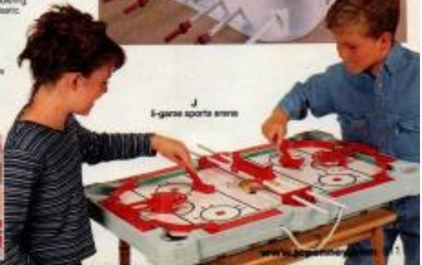
J 5-game sports arena