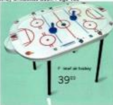
† Total air hockey 39 99

Total pitching and batting control. Scoreboard displays visitor and home team scores, inning balls, strikes and outs. Plastic ball. 20x26x19 1/2" USA. Ages 8 and up.† XU-052-0381 $49.99