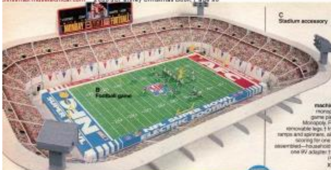
C Stadium accessory

christmas.musical.com 2000 JCPenney Christmas Book Page 90